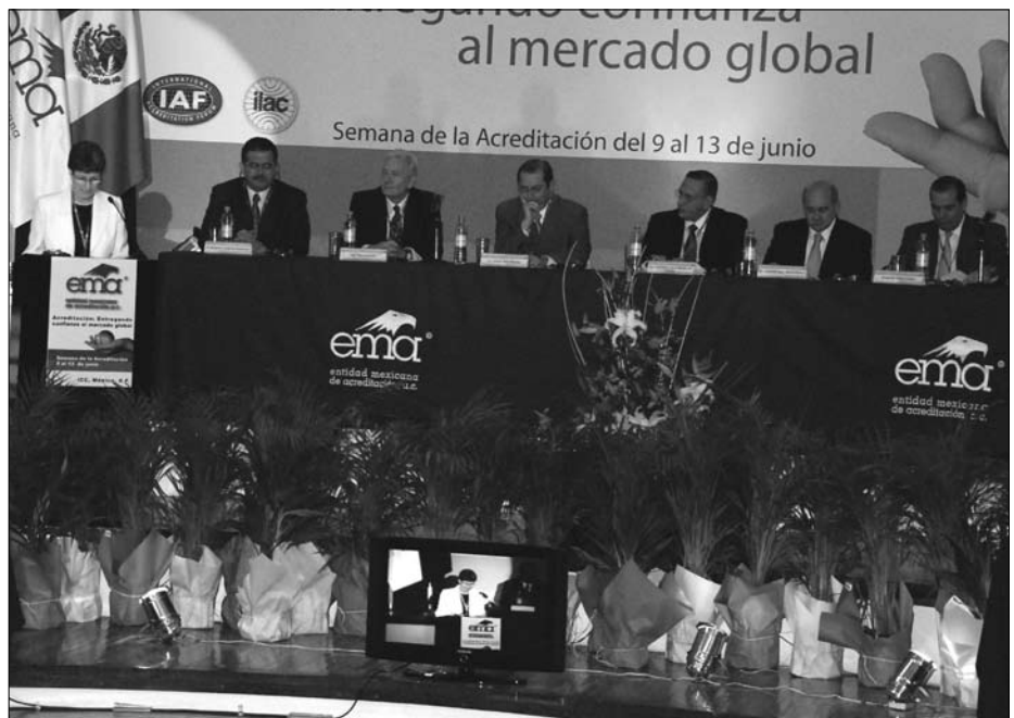
Panel of local and international speakers at the ema conference for accreditation day.

sector of the country. The importance of accreditation to the academic sector was also addressed.