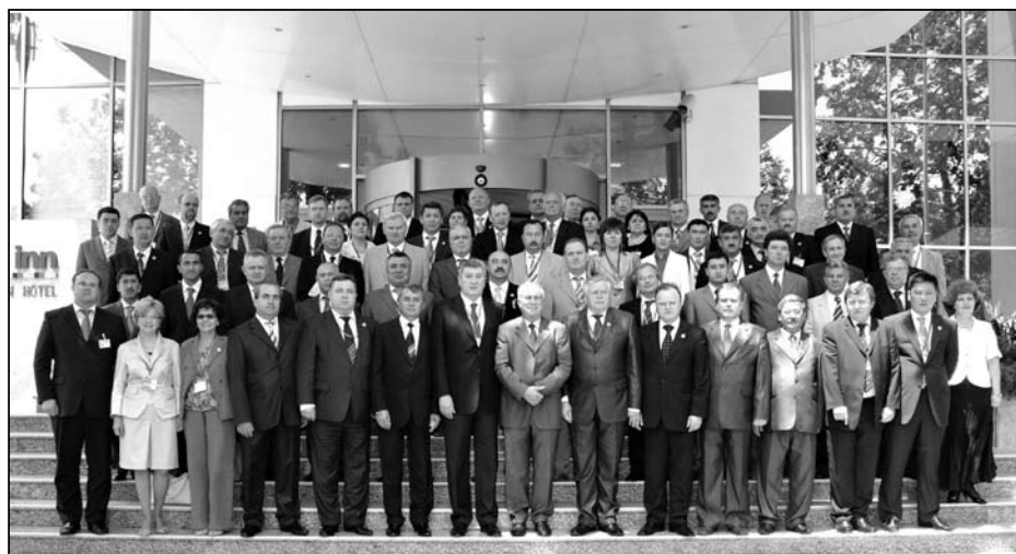
Delegates at the 33rd EASC meeting held in Baku, Azerbaijanian Republic.