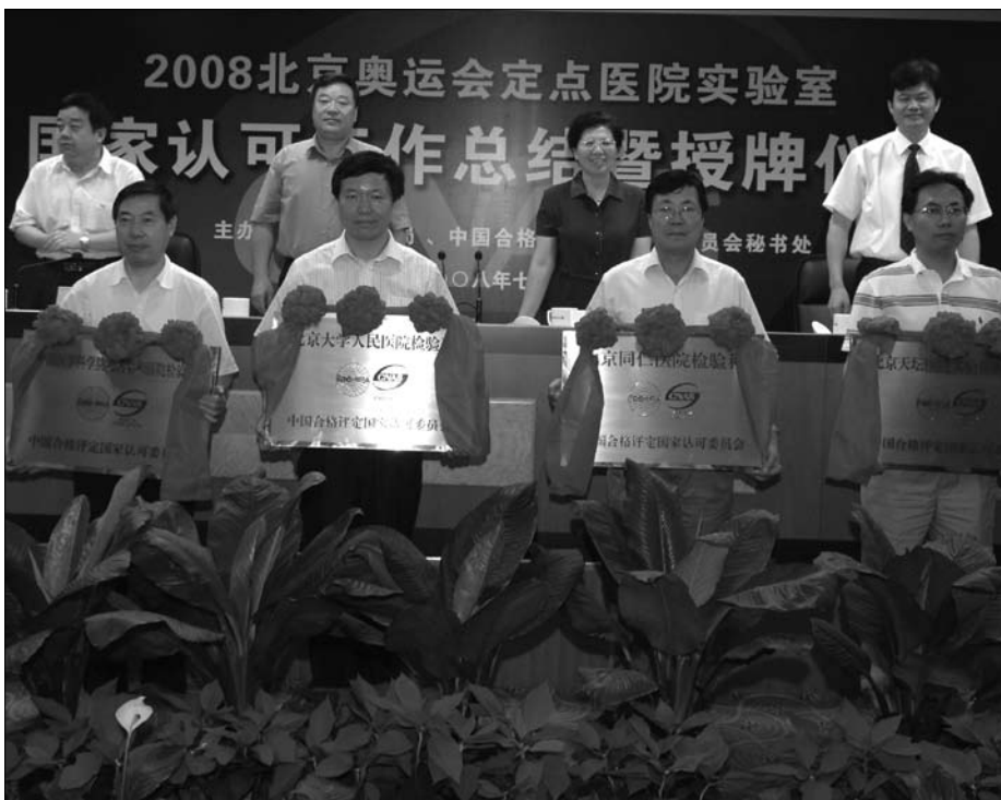
A ceremony is held to grant accreditation to medical laboratories designated for 2008 Beijing Olympic Games.

Nineteen medical laboratories have obtained accreditation from CNAS at a ceremony in Beijing on 11 July, including laboratories of the Chinese PLA General Hospital, Beijing Tongren Hospital, Beijing Hospital and Beijing Union Hospital.