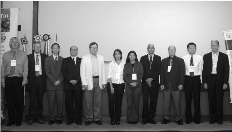
Seminar on Reference Material Producer and Proficiency Testing Provider Accreditation, Rio de Janeiro, Brazil.

The 31st Meeting of the Reference Materials Committee (ISO/REMCO) was held from 10 to 13 June 2008, in Rio de Janeiro, Brazil. The Committee is responsible for the elaboration and revision of ISO Guides related to reference materials, the key elements in assuring reliability and metrological traceability of measurement results made by laboratories in various technological fields.