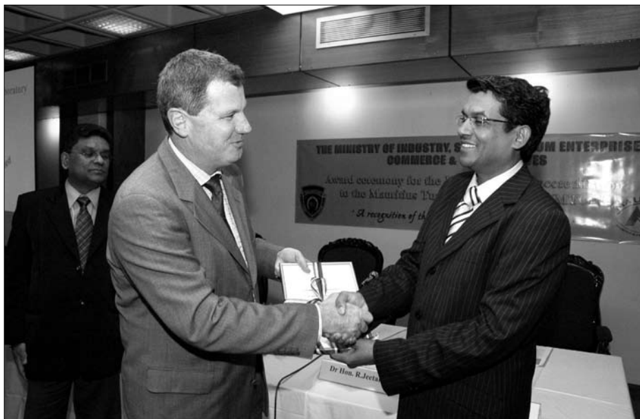
Minister Jeetah awards the MAURITAS accreditation certificate to the first laboratory in Mauritius.

MAURITAS now expects to accredit more and more laboratories in the coming months, and will also start the process of accrediting its certification bodies in collaboration with Norwegian Accreditation.