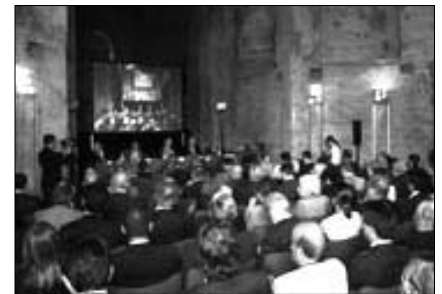
The audience in the picturesque Sala Adriana, that dates back to ancient Rome.

The main issue of the symposium was the new European Regulation setting out the requirements for accreditation and market surveillance, related to the marketing of products, that was approved by the European Council on 23 June 2008, and to become operational by 1 January 2010. This is part of a broad package of measures adopted with