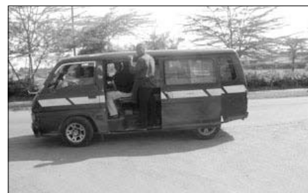
Need for competence in the inspection of motor vehicles, for example, inspection of the Public Service Vehicles (PSV) that include the 'Matatu'.