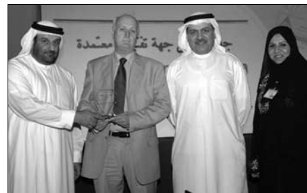
Award presentation to best accredited inspection body.